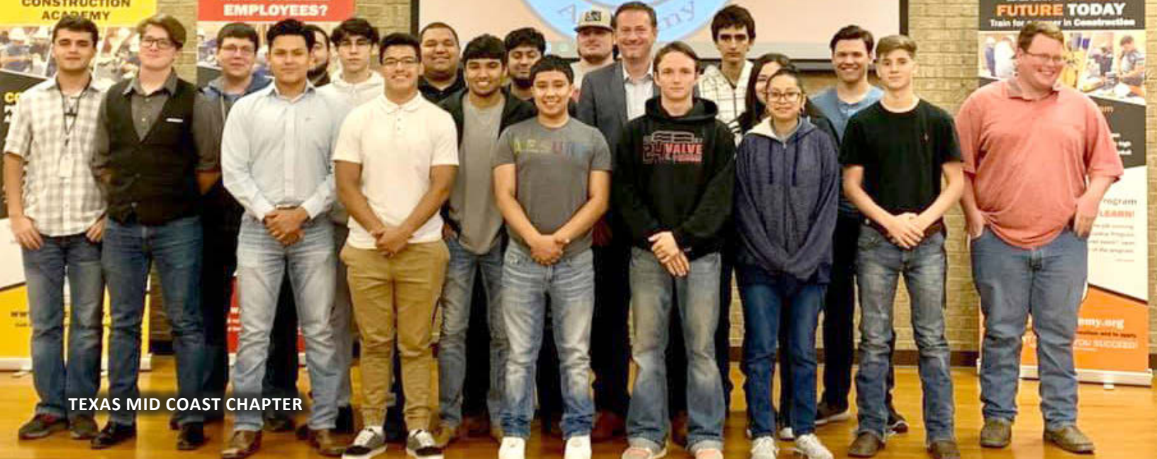
TEXAS MID COAST CHAPTER

Employers visited the MCA to preview the work and portfolios of local high school students and visit with them about future employment. Guest speakers have visited the MCA to see the student's work stations, offer feedback, offer summer job opportunities and educate on topics such as intrapreneurship, personal journeys to becoming professions, how the trades have impacted lives and supported families, and workplace communication. Congressman Michael Cloud also visited the students to learn more about the program.