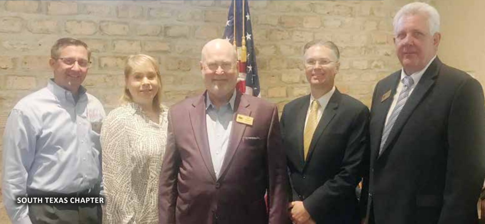
SOUTH TEXAS CHAPTER

On September 18, the Central Texas Membership Committee and Board of Directors will come together to hold a "Member Tele-GROWTH" membership drive, with the goal of adding 10 additional contractor members.