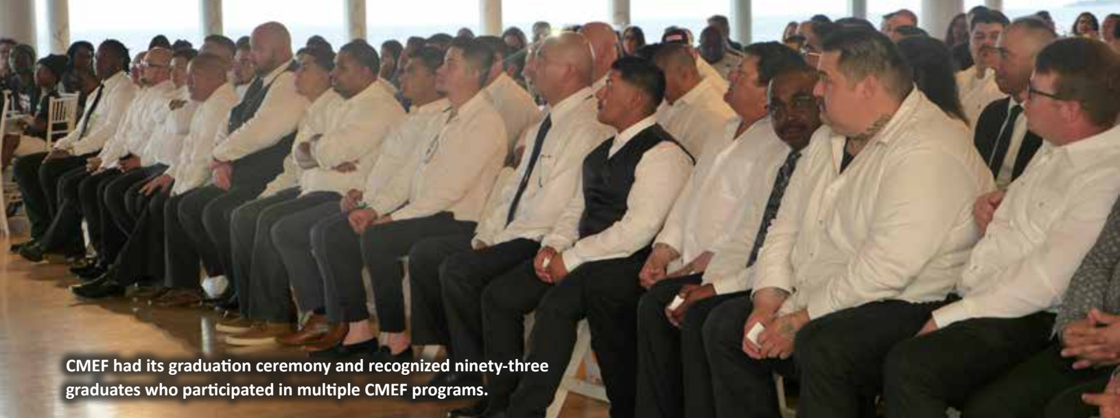
CMEF had its graduation ceremony and recognized ninety-three graduates who participated in multiple CMEF programs.