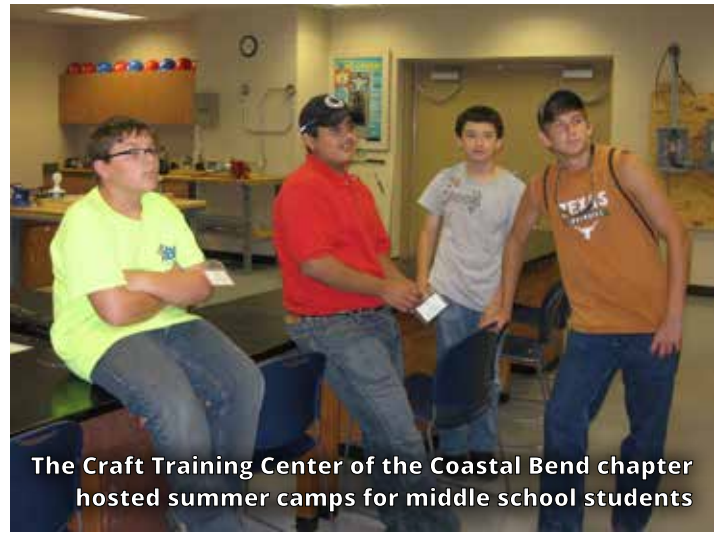
The Craft Training Center of the Coastal Bend chapter hosted summer camps for middle school students

During the past few months, the Chapter has had the opportunity to host several events and networking opportunities comprised of the Monthly First Wednesday Mixers and the 30th Annual ABC Golf Classic. The monthly mixers are always a great way to meet and mingle with members and an excellent sponsorship