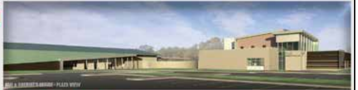
BILL & BRENDA'S BRIDGE - PLAZA VIEW