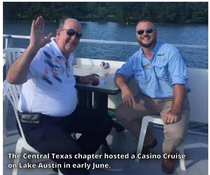
The Central Texas chapter hosted a Casino Cruise on Lake Austin in early June.

The chapter's annual spring golf tournament was held on May 16 at the historic Lions Municipal Golf Course in Austin. Lions is the favorite hometown course of Ben Crenshaw, and many of the tournament's early arrivals were delighted to have a chance to meet him. The tournament was a sell-out and the weather was perfect.