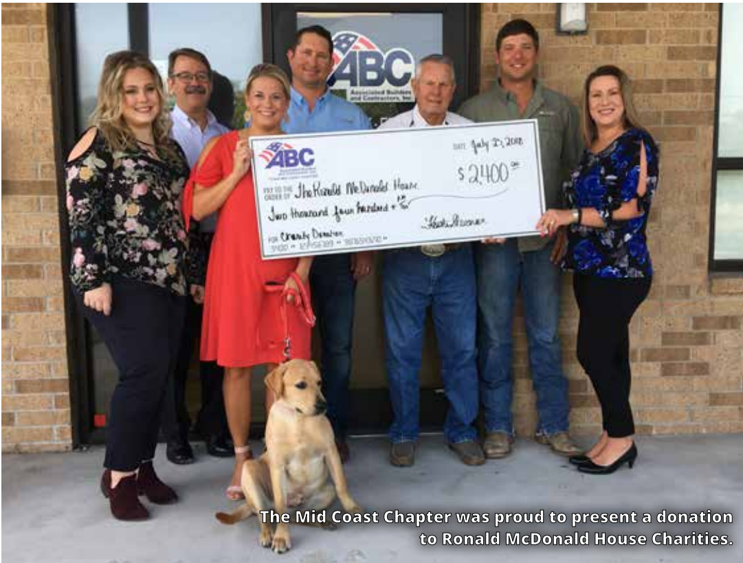
The Mid Coast Chapter was proud to present a donation to Ronald McDonald House Charities.

construction industry. For more information, please call 361-572-0299 or www.mcademy.org .