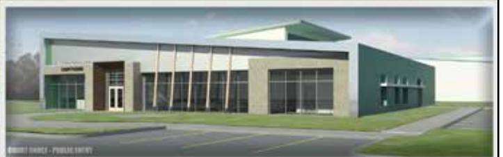
ENTRANCE - PUBLIC ENTRY