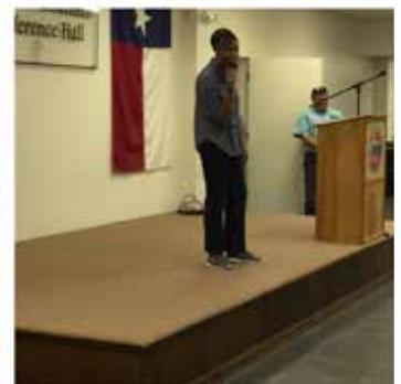
Southeast Texas Chapter held their annual summer camp program known as "Camp Bright Star", which provides children ages 12 through 17 with community-based enrichment activities, literacy programs, and field trips