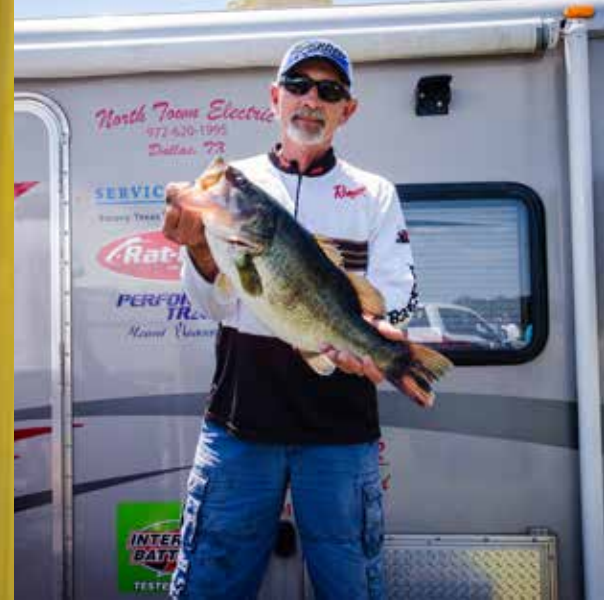
The 2016 ASA/TEXO Bass Classic kicked off the TEXO Challenge Cup competition. More than 100 boats participated.

morning would find themselves in the most competitive of all of the TEXO Challenge Cup events.