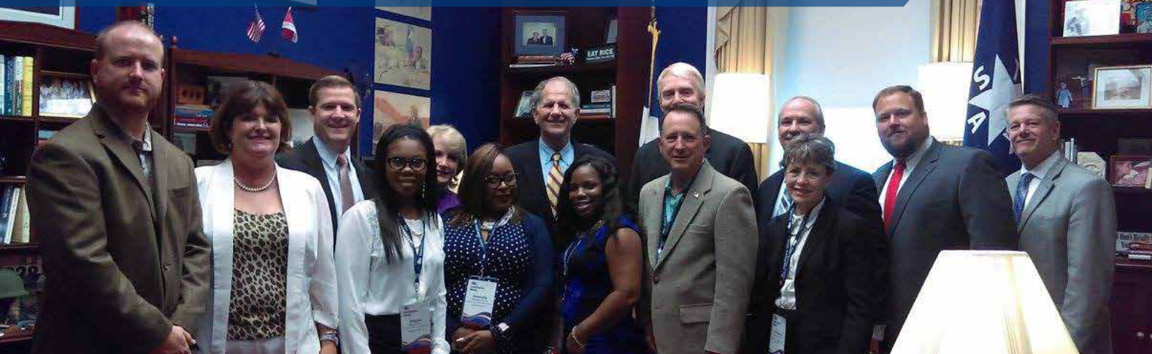
In June, nineteen ABC Greater Houston Chapter members made the trek to Washington, D.C. for the 2016 ABC Legislative Conference.