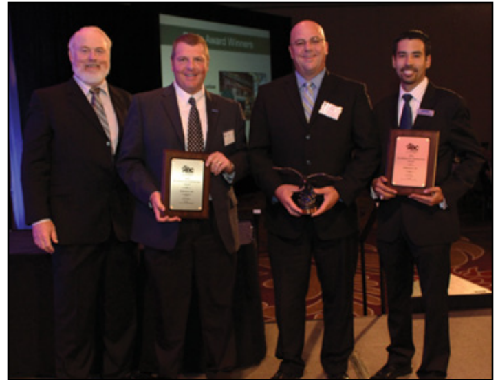
The South Texas Chapter hosted the annual Excellence in Construction Awards banquet where over 280 members and guests applauded this year's winners in 21 construction categories, four STEP categories and the six individual chapter awards.

ABC Central Texas is honored to have them as their charity this year. There was a live and silent auction at the new Shoal Crossings Event Center in Austin. Items included autographed football jerseys by Earl Campbell & Ryan Tannehill, Roger Staubach autographed football helmet, fishing trips, hunting trips, Texas Motor Speedway tickets and hotel night, a Rolex watch, an over and under shotgun, fishing rods, Appaloosa Colt, rounds of golf and much more. Barbeque was served at the Denim & Diamonds Gala.