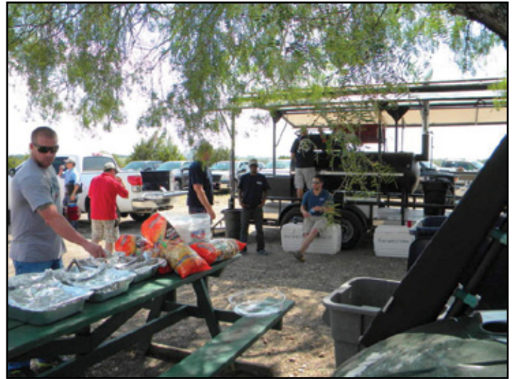
A total of 22 teams participated in the ABC Central Texas Clay Shoot at Capitol City Trap and Skeet Club. Prizes were given out to 1st, 2nd, 3rd and overall top shooter. Guest were treated to sausage wraps after they were through shooting.