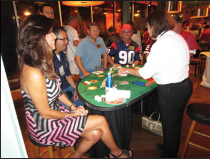
ABC Greater Houston Members and guests enjoyed a festive evening of gaming for prizes during the 2012 Casino Night at Minute Maid Park. Proceeds raised at the event go toward the Scholarship Fund which helps college students pursuing a career in construction.