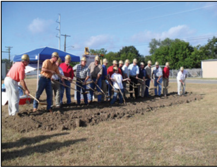
On August 16th, the Past Board Chairmen and current Board of Directors and members of the ABC Mid Coast Chapter came together with gold hard hats and gold shovels to break ground on the site where the Chapter's new building will be built.