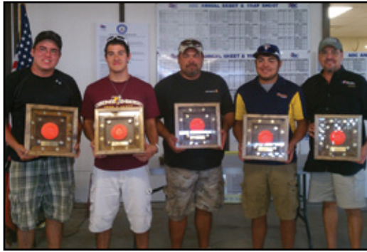
The 10th ABC Texas Coastal Bend Annual Skeet & Trap Shoot took place September 9 -10. Committee volunteers worked to make this shoot the best in the area.