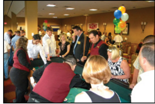
On August 4th, the ABC Central Texas Chapter hosted a PAC Casino Party to raise over $5,100 for the Chapter's PAC.