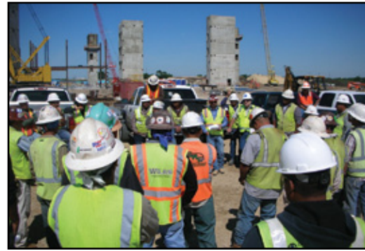
The TEXO Chapter held the Spring Construction Industry Stand-Down. This year, 66 projects participated, accounting for over $6 billion of work being stopped to focus on safety.

the Chapter sponsored two members of the Young Constructors Council to attend the Legislative Conference in June. This helped to broaden their knowledge of ABC's role in National politics as well as help them understand the importance of communicating industry issues directly to our elected officials.