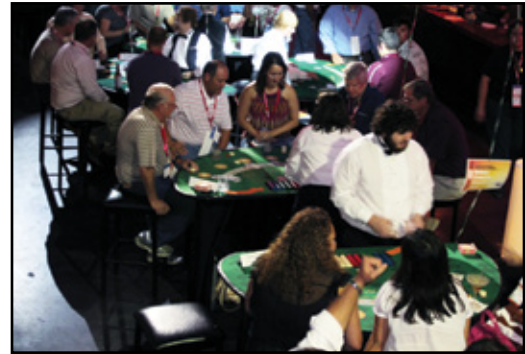
Over 180 Members of ABC Greater Houston enjoyed casino styled gaming in a rock and roll setting at the 2011 Casino Night.

directors is in the process of preparing the 2012 Program of Work and strategic plan for the next few years. One of the key goals for 2012 will be the hiring of a Marketing/Membership Director.