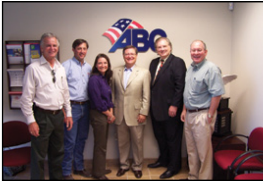
ABC South Texas Chapter representatives met with Congressman Quico Canseco to discuss some of ABC's national issues in August.