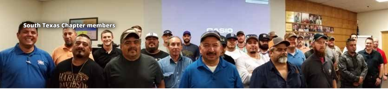
South Texas Chapter members

with the County". Judge Sebesta's presentation highlighted the current growth of the county, much of it driven by the large amount of industry investment in capital projects in the area, and how this growth will impact local communities.