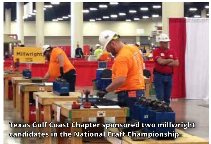
Texas Gulf Coast Chapter sponsored two millwright candidates in the National Craft Championship