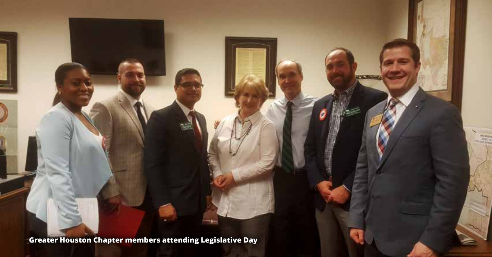
Greater Houston Chapter members attending Legislative Day

In July, ABC Greater Houston is partnering with NextOp, Lone Star Veterans Association, and ECHMA to host a Warrior for Life luncheon that will focus on the trade jobs that make up the bulk of construction activities. Veteran attendees will have the opportunity to meet companies one-on-one over lunch to get to know details about the company, its culture, and what your first year looks like.