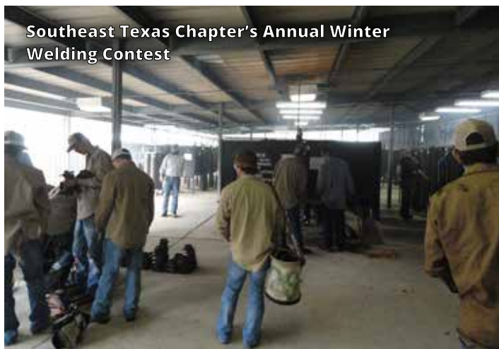
Southeast Texas Chapter's Annual Winter Welding Contest

After learning about community-based training, ABC and CMEF hosted an open house to showcase the benefits and importance of contributing and the many opportunities one has to build and develop their career in construction.