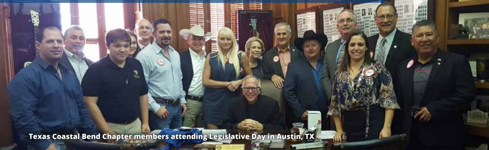
Texas Coastal Bend Chapter members attending Legislative Day in Austin, TX