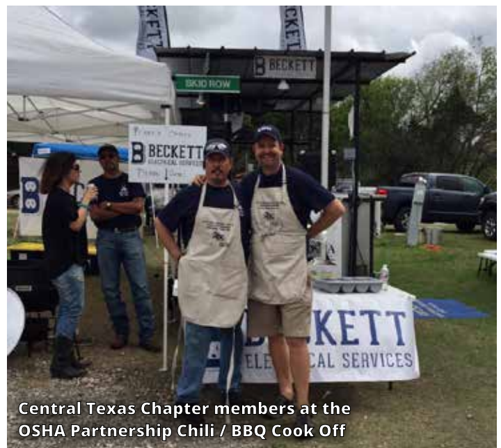
Central Texas Chapter members at the OSHA Partnership Chili / BBQ Cook Off

Along those lines, the chapter has focused in on safety training and professional development programming for members and industry professionals. In the first quarter, two panel discussions centered around the topic of building sequencing/manpower/communication. One panel was made up of General Contractors discussing the issue, and the next panel was made up of Sub Contractors discussing the same. Both sides came away with a clearer understanding of best practices to improve job efficiencies through improved communication and sequencing. The Train the Trainer series continues to pack a full house of safety managers gaining valuable tips on various aspects of safety, including trainer liability, recordkeeping updates, and improving the safety manager and ownership relationship.