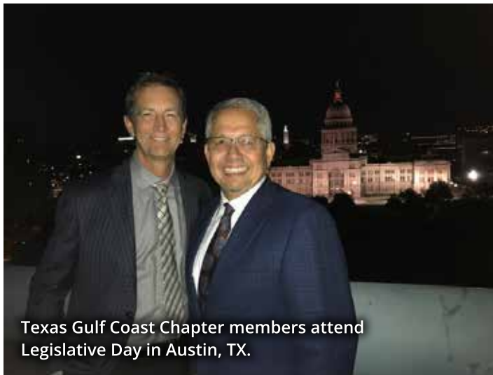
Texas Gulf Coast Chapter members attend Legislative Day in Austin, TX.

Biennially, all eight ABC Texas chapters join as one powerful voice to inform legislators about the issues affecting the construction industry and to showcase the opportunities and diversity ABC members contribute to our industry and the economy. During this event, seasoned Legislative Day veterans and new members share their testimonies and stories to their respective legislator.