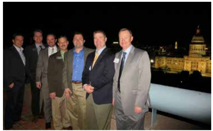
ABC South Texas Chapter takes on the capitol at this year's legislative day. They spoke directly to their representatives the needs in the construction industry.

A mutually beneficial bidding process cannot be derailed by political cronyism or cost cutting shortcuts. The city needs a new justice complex and needs to thoroughly review proposals made by those legally qualified to make proposals. ABC Greater Houston is taking action with the procurement office and city council to clarify the city's bidding procedures and ensure public work is fairly awarded based on merit.