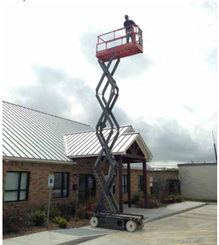
The Mid Coast chapter held a number of safety training and education classes including a scissor lift training.