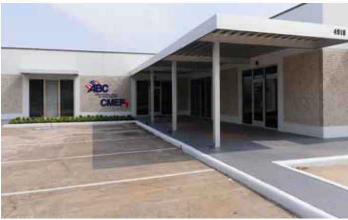
ABC Greater Houston opened up their new office and training facility. With membership support, the chapter was able to raise nearly $200,000.