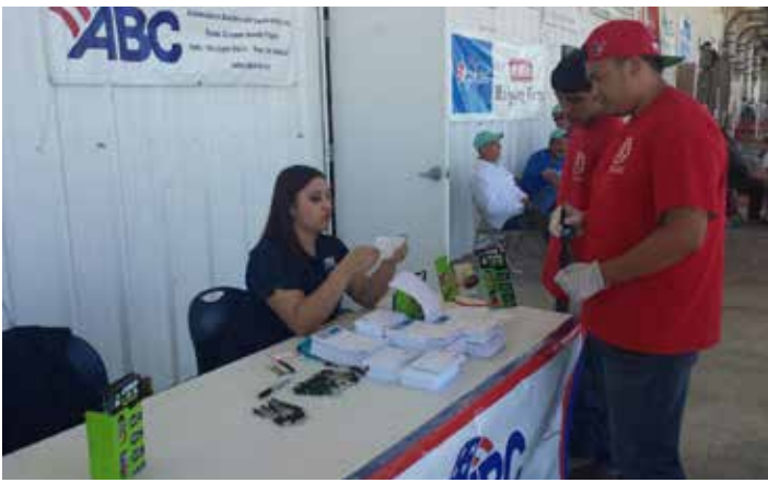
ABC Coastal Bend hosted the 67th annual SkillsUSA Championship at the end of March, a trade's competition where high school and college compete in their crafts.