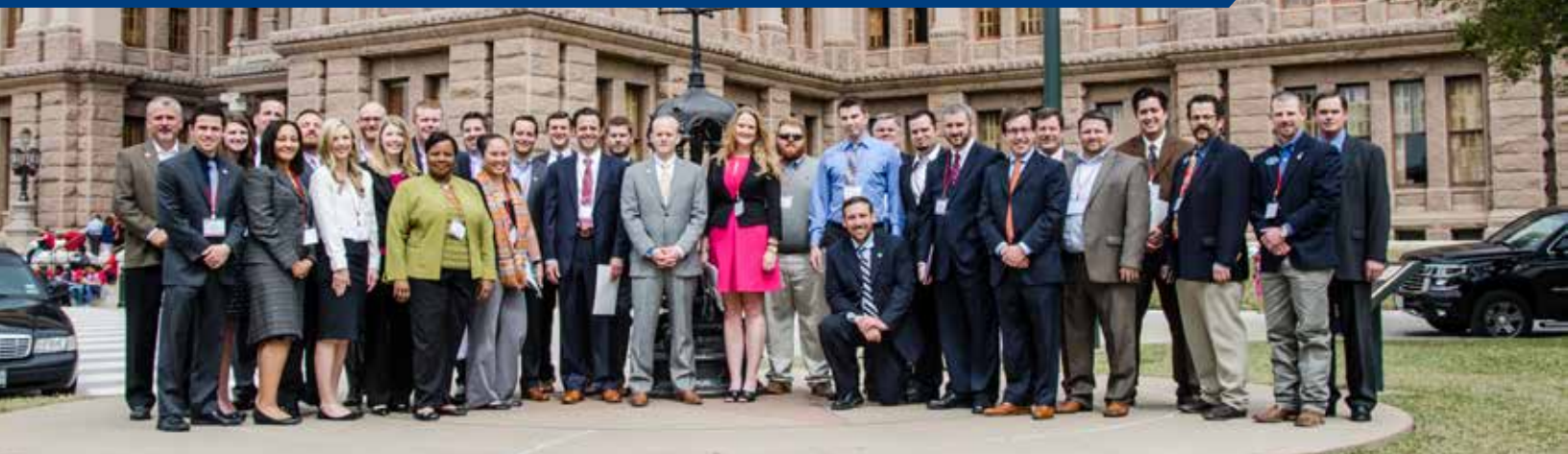
TEXO's Young Constructor's Council joined with AGC Chapters for their Legislative Day and were able to meet with several representatives. They also heard remarks from Lieutenant Governor Dan Patrick in preparation for their visits the following day.