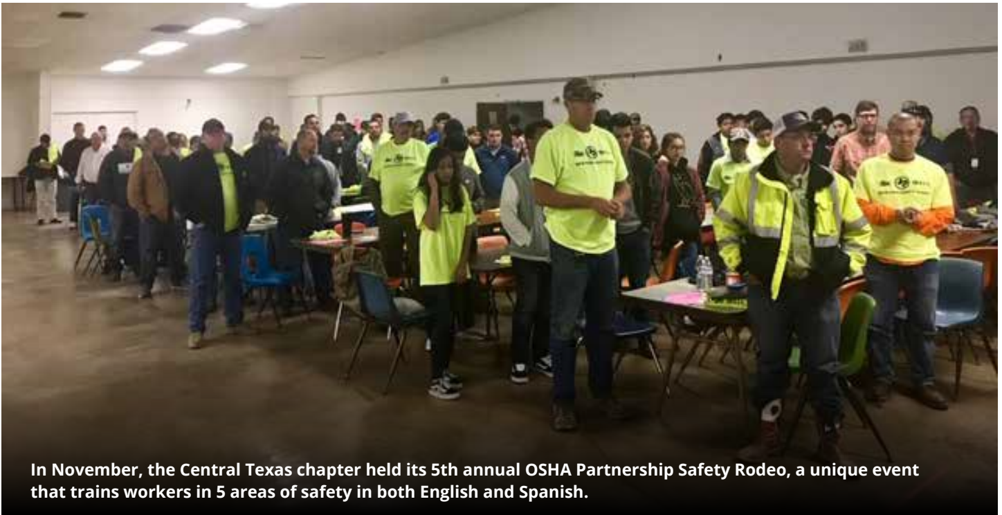
In November, the Central Texas chapter held its 5th annual OSHA Partnership Safety Rodeo, a unique event that trains workers in 5 areas of safety in both English and Spanish.

Most recently TEXO signed an Alliance with its local OSHA area offices; Dallas and Fort Worth. Through this Alliance, TEXO and OSHA will work together to provide assistance with member safety programs and training development. The Alliance also opens the door for TEXO members to participate in jobsite specific partnerships where OSHA and the contractor share a mutual commitment to safety so that EVERY construction worker goes home every day safe and healthy.