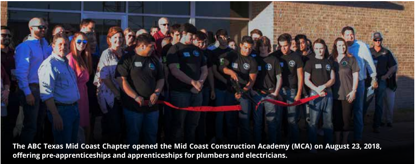
The ABC Texas Mid Coast Chapter opened the Mid Coast Construction Academy (MCA) on August 23, 2018, offering pre-apprenticeships and apprenticeships for plumbers and electricians.

A Boy Scout first aid/CPR class was conducted at no charge in November, and plans are underway to participate in the 2019 Merit Badge Academy. The construction career pipeline effort is being expanded to include middle schools and elementary schools. These outreach efforts with area high schools have resulting in chapter members hiring high school student interns. Finally, the chapter is looking into the feasibility of a pre-apprenticeship program with a number of area high schools. Meetings have been held with the Department of Labor to review standards, work requirements, regulatory and recordkeeping requirements, and chapter liability.