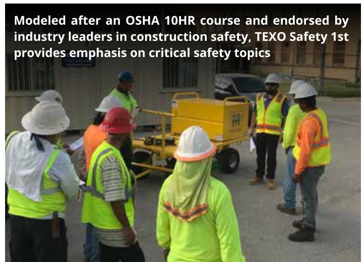
Modeled after an OSHA 10HR course and endorsed by industry leaders in construction safety, TEXO Safety 1st provides emphasis on critical safety topics

In North Texas, TEXO and its members are striving to do more, to make an impact and to make sure workers go home to their