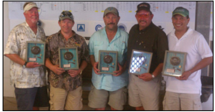
The highly successful ABC Texas Coastal Bend Annual Skeet and Trap Shoot raised money for the ABC PAC account and the John "Jocko" Taylor Scholarship fund.