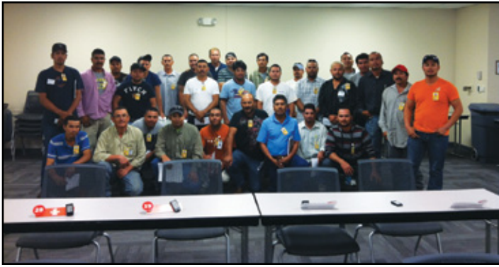
TEXO celebrated numerous achievements in 2013, and one of those achievements which stand out the most is TEXO's Safety First Program.