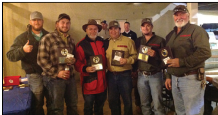
The South Texas Chapter's Sporting Clays Shoot hosted over 140 shooters at the National Shooting Complex with BG Metals taking first place.