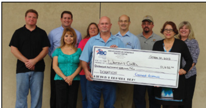
The Texas Gulf Coast Chapter Public Relations/ABC Cares committee recently donated over $6,000 to various local charitable organizations and food pantries.