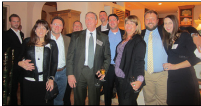
The Greater Houston Chapter ended the year with the annual Holiday Party Fundraiser which helped the chapter gain substantial ground towards reaching their $75,000 goal.

On the events front, 290 members attended the Excellence in Construction (EIC) Banquet. The EIC awards competition has two levels, the top honor being the EIC Award of Excellence and the next level being the EIC Award of Merit. The EIC strives to honor those who exemplify the highest quality of workmanship in their projects, while upholding a dedication to building projects on time and on budget. There were 30 EIC entries, 20 safety entries and 17 STEP winners.